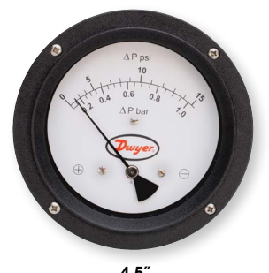
Shown with optional pointer follower